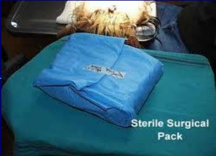
Sterile Surgical Pack