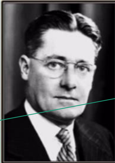
Howard Florey (1898-1968)