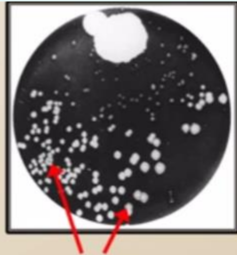
Colonies of Staphylococcus aureus