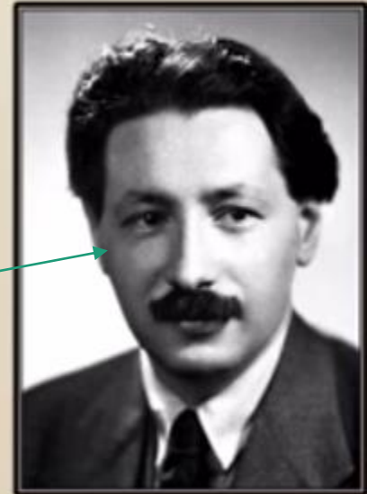
Ernst Boris Chain (1906-1979)