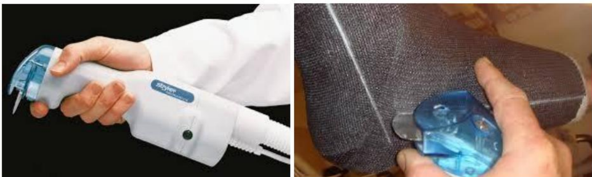
Figure: Handling of the saw, in and out controlled cuts.