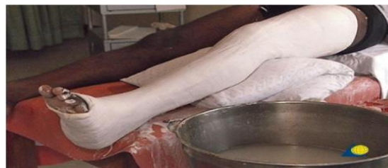
Figure: Distally the distal palmer crease should be seen, for distal lower limbs all the toes are exposed.