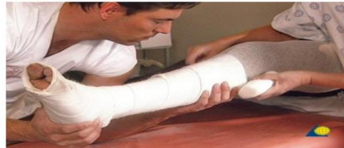
Figure: 50% overlap for the soft rolls when applied.