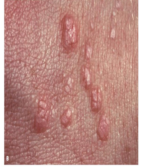
Figure 14-23. Lichen planus (A) Silvery-white, confluent, flat-topped papules on the lips. Note: Wickham striae ( arrow). (B) Lichen planus, Koebner phenomenon. Linear arrangement of flat-topped, shirry papules that erupted after scratching.