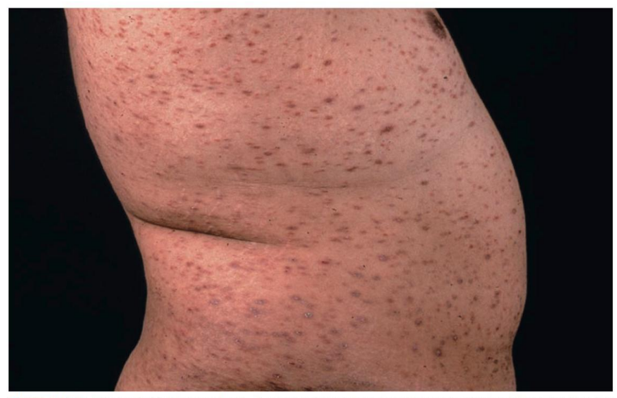
Figure 14-22. Disseminated lichen planus A shower of disseminated papules on the trunk and the extremities (not shown) in a 45-year-old Filipino. Due to the ethnic color of the skin, the papules are not as violaceous as in Caucasians but have a brownish hue.