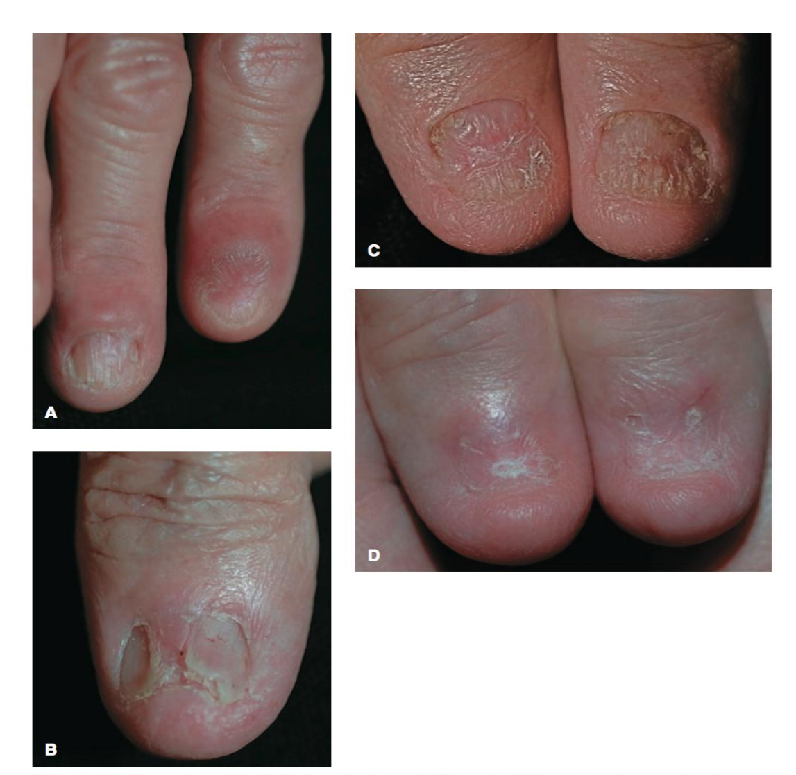
Figure 32-9. Lichen planus (A) Middle finger: involvement of the proximal fold and matrix has caused trachonychia, longitudinal ridging, and pterygium formation. Index finger: destruction of the matrix and nail plate is complete with anonychia. Seven of ten fingernails are involved; the others are normal. (B) Involvement of the nail matrix with scarring or pterygium formation proximally dividing the nail plate in two. (C) Early involvement of the matrix with thinning of the thumbnail plates. (D) Same patient as Fig. 32-8C 2 years later, the nail plate is completely destroyed, i.e., anonychia.