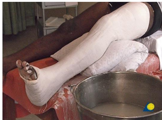
Figure: Distally the distal palmer crease should be seen, for distal lower limbs all the toes are exposed.