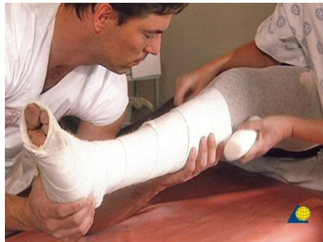
Figure: 50% overlap for the soft rolls when applied.