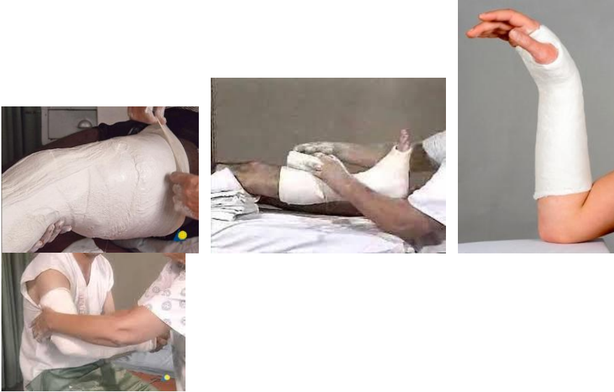
Figure: for above knee at upper third of thigh (note folding of the stockinette to make smooth upper end), for below knee the proximal end just below tibial tubercle, for below elbow two fingers width below elbow crease and above elbow just below deltoid insertion.