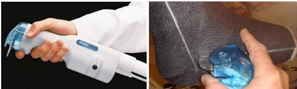
Figure: Handling of the saw, in and out controlled cuts.