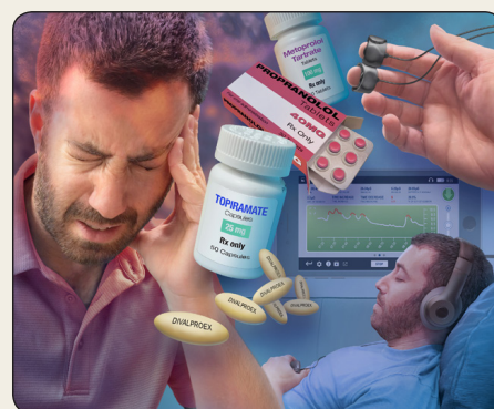
Illustration by Scott Bodell

The disabling nature of migraine headaches causes frequent visits to outpatient clinic and emergency department settings, imposing significant health and financial burdens. Headaches rank among the top five reasons for emergency department visits and top 20 reasons for outpatient visits. 1 The prevalence of migraines is an estimated 16%; they are more common in women, with a peak sex prevalence ratio of 3:1. 1 Approximately 38% of persons who have episodic migraines would benefit from prophylactic therapy, but only 3% to 13% obtain it. 2