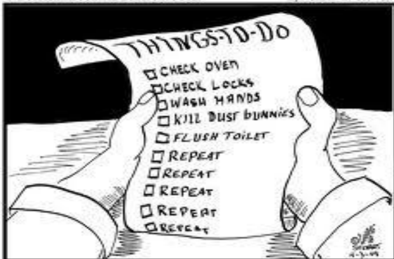
Obsessive-Compulsive Disorder To Do List